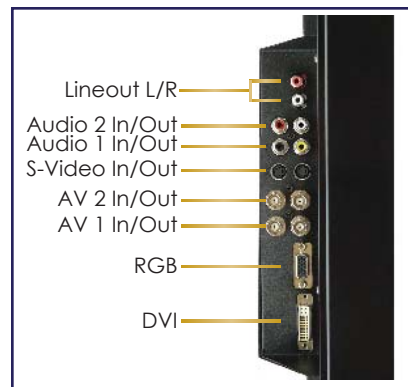
Side View (Connectors)